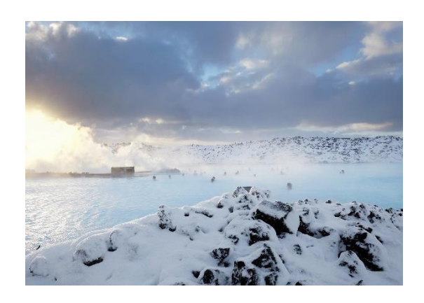
DAY 4-28 February Agriculture School + Hellisheiði GeothermalPower Plant

After all this we drive through rugged lava fields to the Blue Lagoon, a unique natural pool of mineral rich geothermal water located in the middle of a lava field in the pure and beautiful Icelandic wilderness. The Blue Lagoon is known for its special properties and its beneficial effect on the skin and attracts visitors from all over the world in search of health, relaxation and an exotic experience. We stop for a refreshing bath or swim in the pleasantly warm mineral-rich water, reputed for its healing properties.